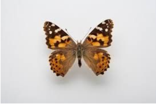
Painted Lady Butterfly, Vanessa cardui

Have you seen painted lady butterflies migrating through your neighborhood?